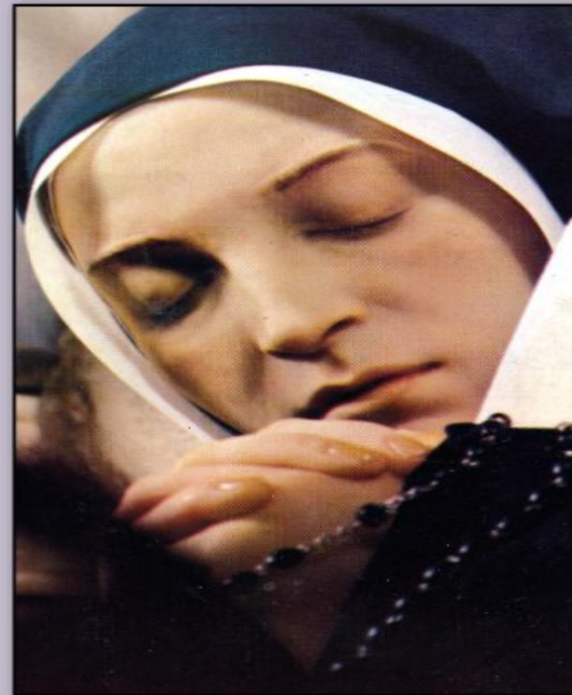
St. Bernadette Soubirous 1844-1879

St. Bernadette of Lourdes, original name Marie-Bernarde Soubirous, also called Saint Bernadette Soubirous, (born January 7, 1844, Lourdes, France—died April 16, 1879, Nevers; canonized December 8, 1933; feast day April 16, but sometimes February 18 in France), French saint whose visions led to the founding of the Marian shrine of Lourdes.